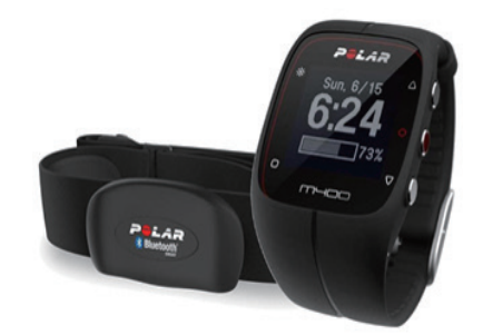
Fig. 4. (Color online) Polar M400, H7 device used for HR measurements.

The resting heart rate (HR<sub>r</sub>, bpm), working heart rate (HR<sub>w</sub>, bpm), and maximum heart rate (HR<sub>max</sub>, bpm) were measured to analyze IHR (%) and HRR (%) as follows:<sup>(3,21)</sup>