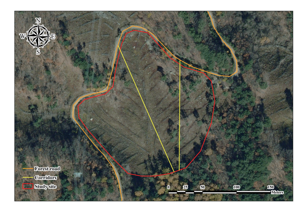
Fig. 1. (Color online) Study site.